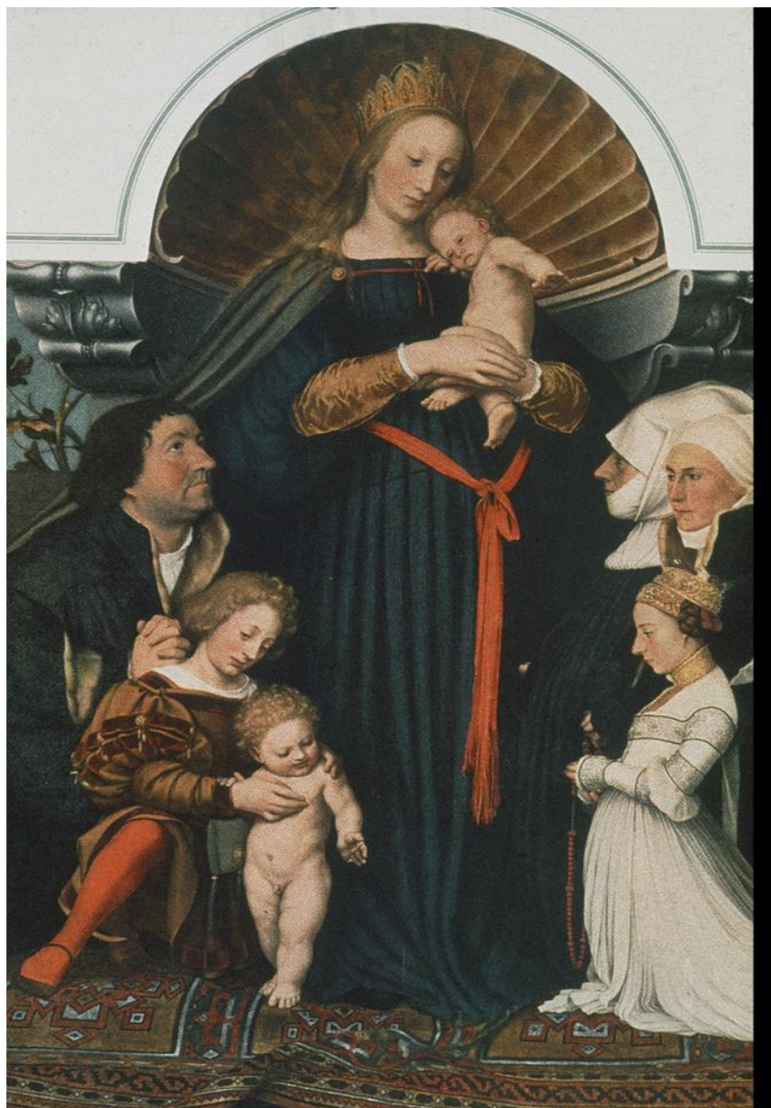
Figure 5. Christ in the Tomb 77