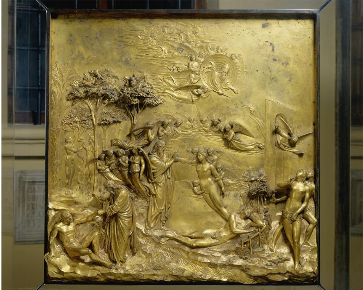
Figure 3. The Madonna of the Chair 75