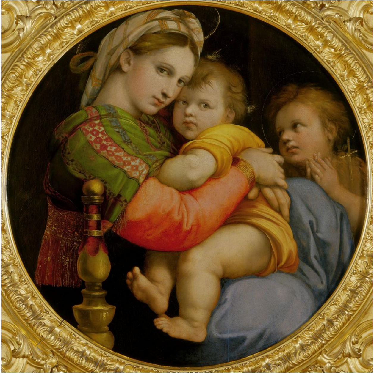
Figure 4. Holbein's Madonna 76