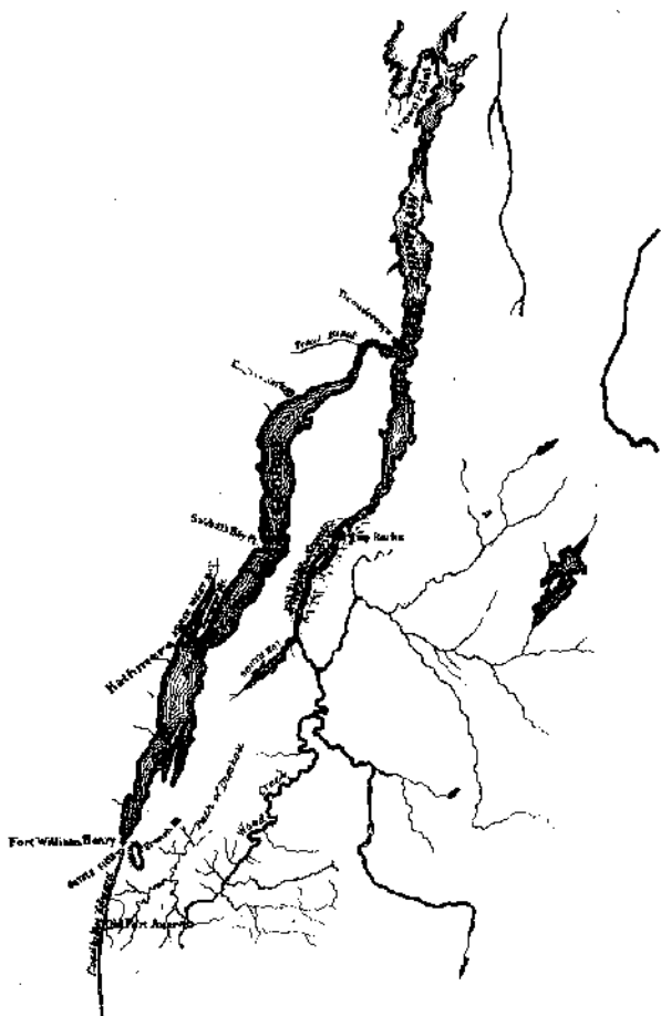
THE REGION OF LAKE GEORGE, From Surveys made in 1762.