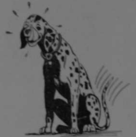
College Mascot rejoices at the success of the Junior Prom