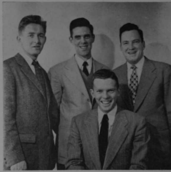
Junior Class Officers