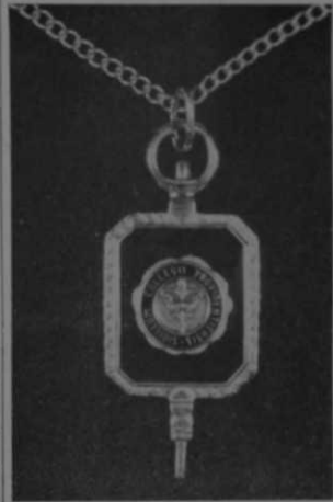
The Prom Favor pictured above is the gift of the Class of 1950 to all the young ladies present tonight. May it serve as a constant reminder of the Junior Prom of 1949.