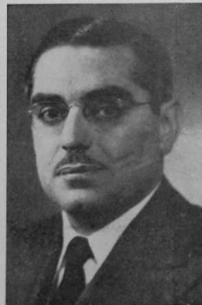
Governor John O. Pastore of Rhode Island