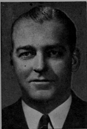
Mayor Dennis J. Roberts of Providence