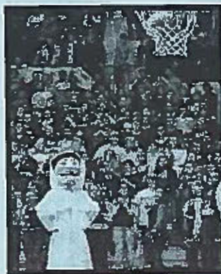
LET'S GO FRIARS!!

Created By: Lauren Michel '07