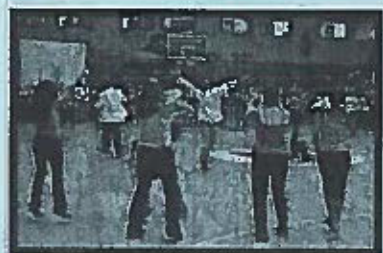
Defending their title from last year, BMSA won the Dance-Off and certainly got the gym moving!