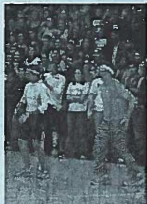
Madness proved to be quite entertaining this year.