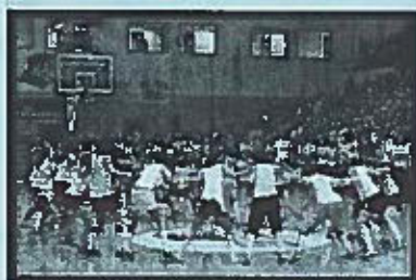
Members of BOP entertaining the crowd during the annual Dance Off.