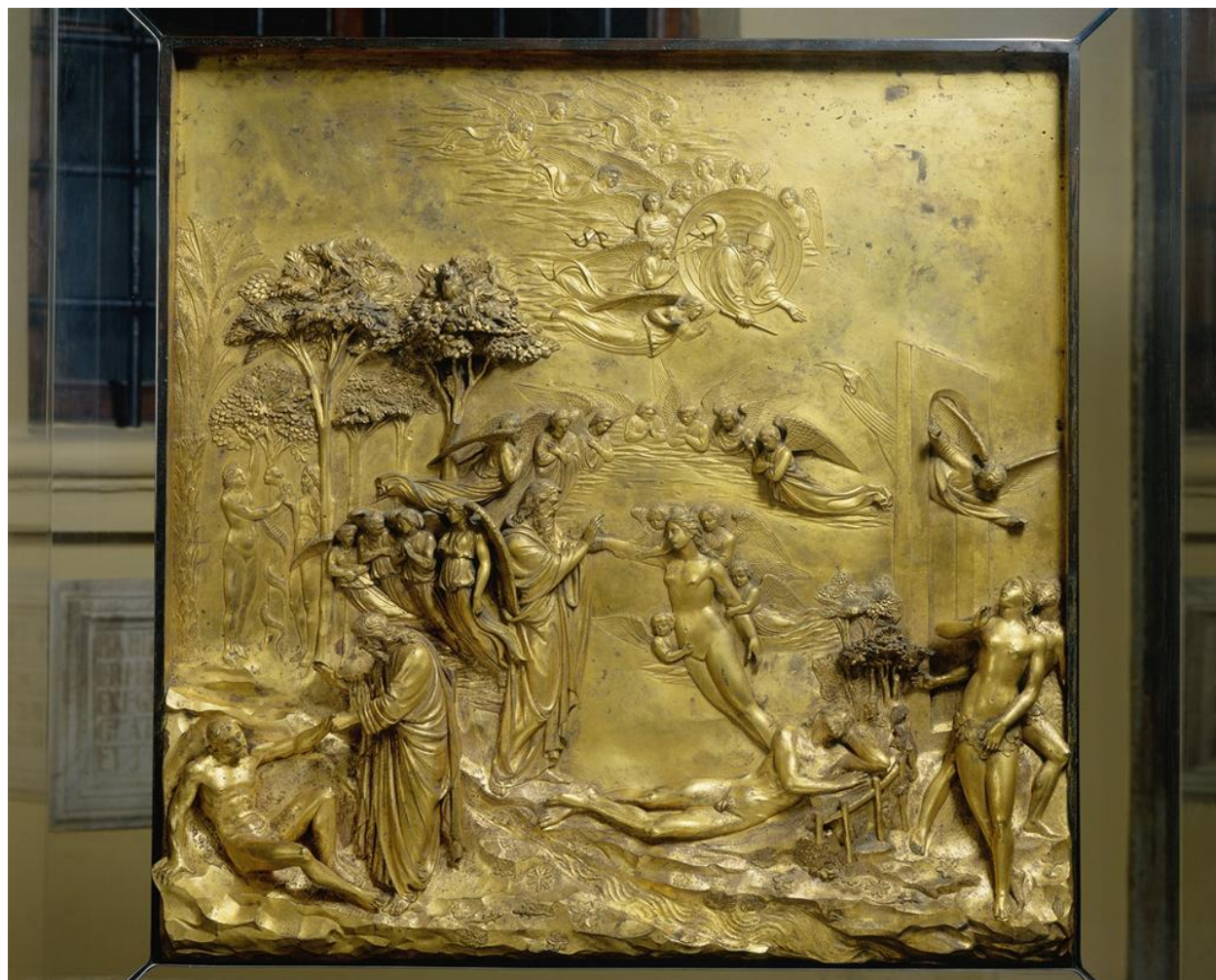
Figure 3. The Madonna of the Chair 75