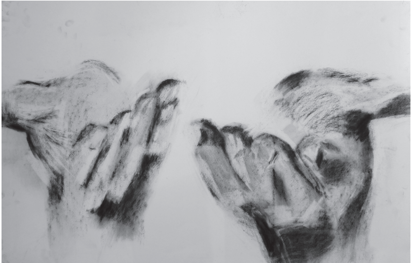
Hands IV 25" x 35" Charcoal on paper