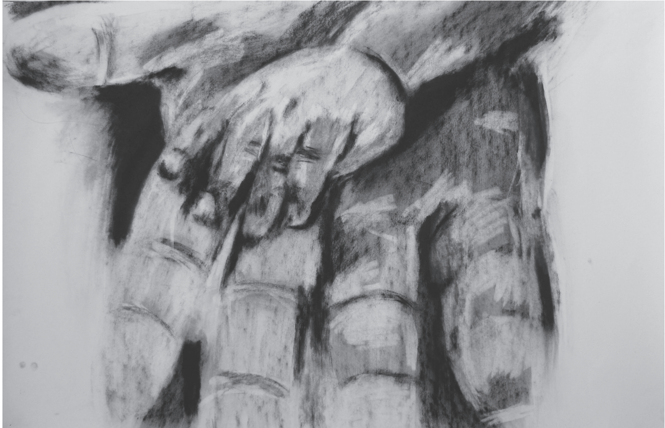
Hands II 25" x 35" Charcoal on paper