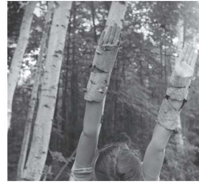
Figure 11: Francesca Woodman, Detail from Daphne series, 1980