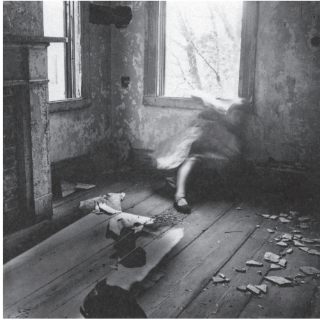
Figure 1: Francesca Woodman, House #3 , 1976