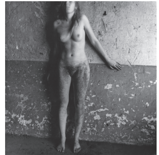
Figure 9: Francesca Woodman, "Untitled" from Roma Series , 1977-78