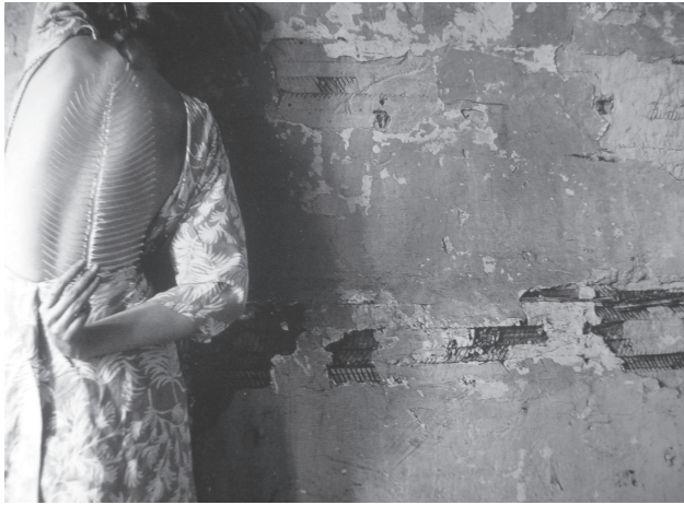
Figure 10: Francesca Woodman, Untitled , 1979