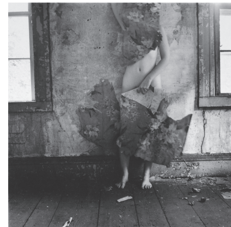
Figure 4: Francesca Woodman, "Untitled" from Space 2 series, 1977