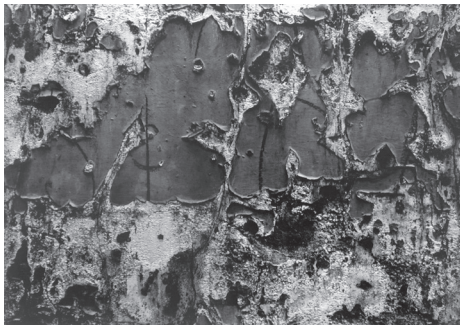
Figure 8: Aaron Siskind, Chicago , 1948