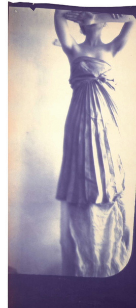
Figure 13: Francesca Woodman, Caryatid , 1980