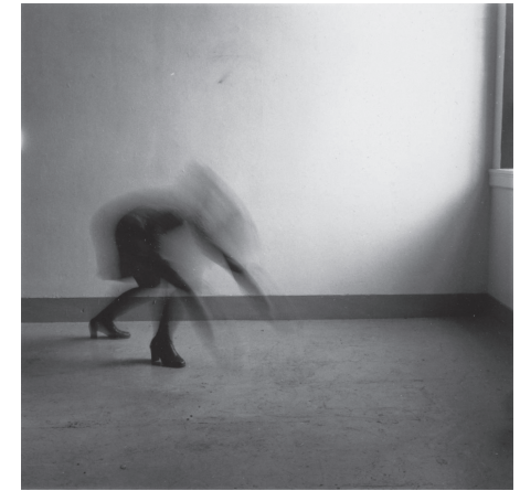
Figure 6: Francesca Woodman, "Untitled" from Space 2 series, 1977