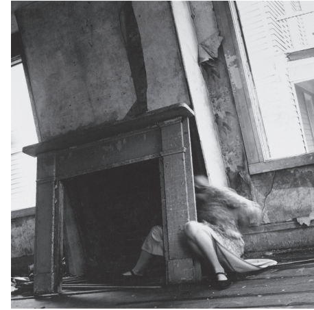
Figure 2: Francesca Woodman, House #4 , 1976