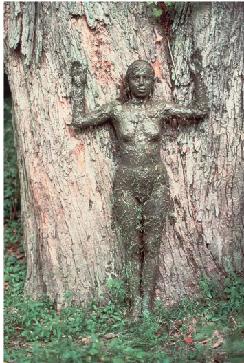
Figure 12: Ana Mendieta, "Untitled" from The Tree of Life series, 1977