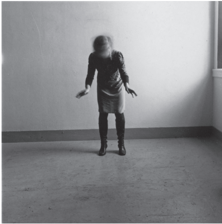
Figure 5: Francesca Woodman, "Untitled" from Space 2 series, 1977