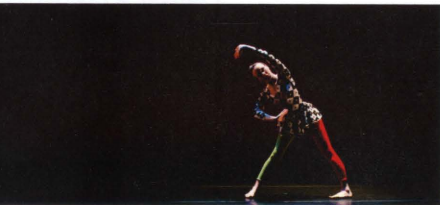
Blackfriars Dance Concert