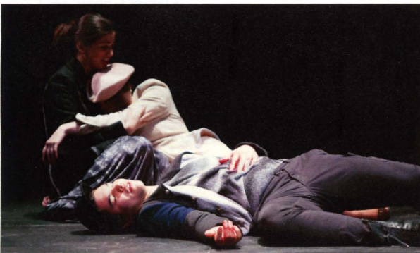
The Illusion by Pierre Corneille, freely adapted by Tony Kushner

Stage Manager Stage Hands Light Board Operator Wardrobe Crew Follow Spot Operator Assistant Stage Manager Sound Board Operator Assistant to the Director Projectionist