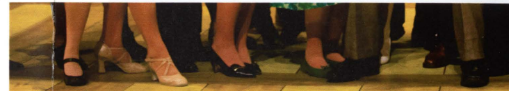
Curtains , music and lyrics by John Kander & Fred Ebb

DEPARTMENT OF THEATRE, DANCE & FILM Smith Center for the Arts Providence College