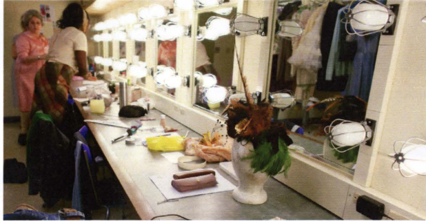
dress rehearsal, The Effect of Gamma Rays on Man-in-the-Moon Marigolds by Paul Zindel

are available for all productions. Learn the nuts-and-bolts of what makes magic happen on stage. Open to all PC students of all levels of experience.