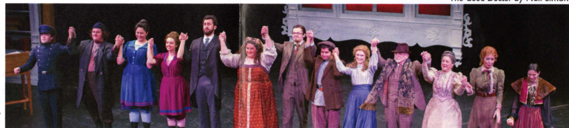
The Good Doctor by Neil Simon