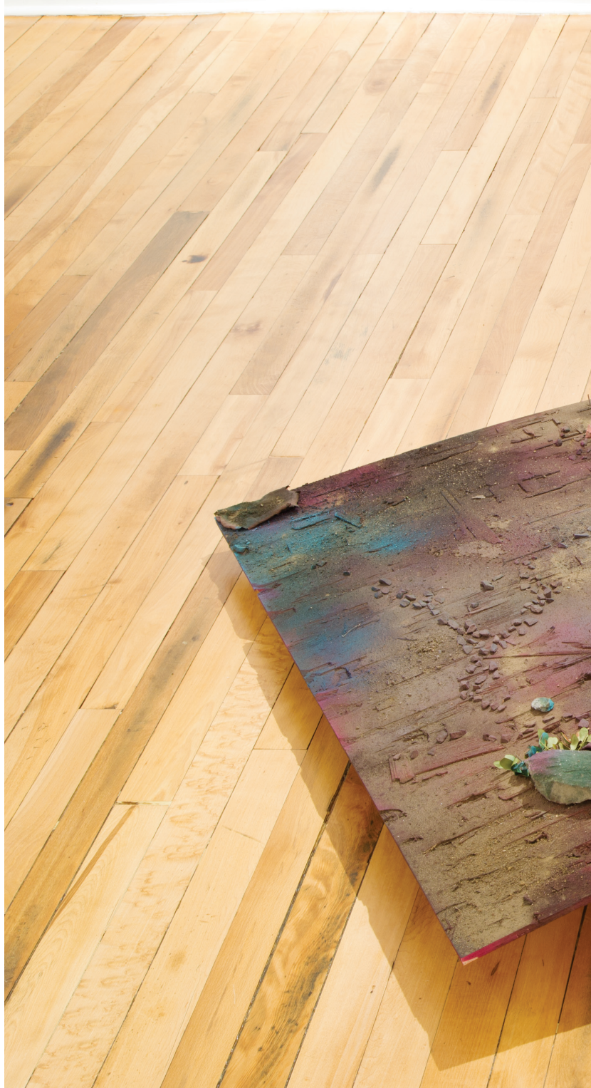
Terrain Model , 2016, Mixed media sculpture, 4 ft x 8 ft