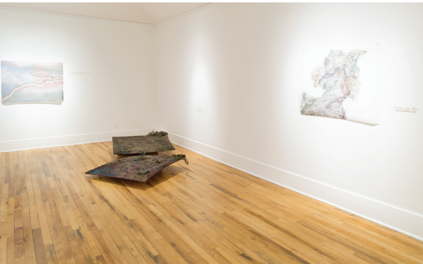
Installation view of Avant Garde , 2016

"I Would Build A Great Wall" , 2015, Digital inject print on vellum, marker, 36 in x 48 in