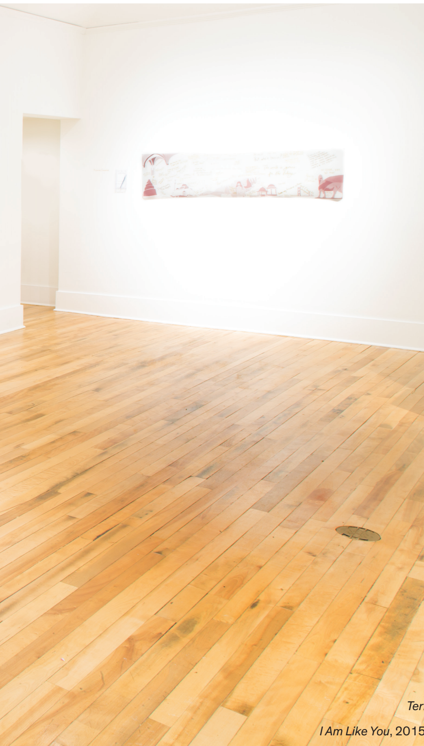
Terrain Model , 2016, Mixed media sculpture, 4 ft x 8 ft