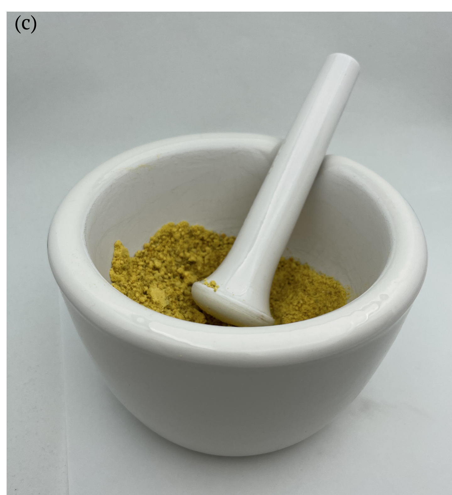
Figures 2. (a) Bees returning to a hive with a pollen trap. (b) Bee collected pollen trapped upon entry to the hive. (c) Homogenized pollen in a mortar and pestle.