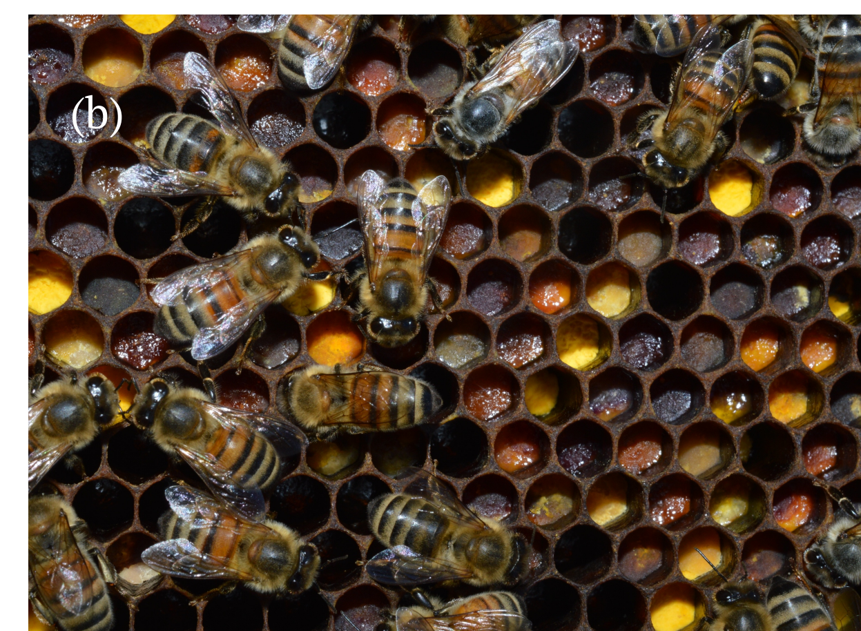
Figure 1. (a) Honey bees on a frame with the semi-synthetic diet. (b) Honey bees on a frame with naturally collected and stored pollen.