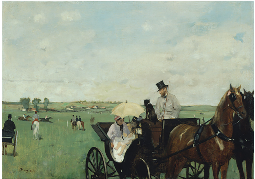
(Figure 2: Edgar Degas. At the Races in the Countryside , 1869. Museum of Fine Arts, Boston.)

Morisot's choice of utilizing a nourrice sur lieu was the norm for someone of her class. It would not have been considered careless or neglectful, for it was within the appropriate cultural constructs of her time. Morisot turning to a wet nurse as subject matter for a painting was not unheard of either. In Degas' At the Races in the Countryside , 1869, he depicts a husband and wife who are accompanied by a wet nurse in the act of feeding an infant (Fig. 2). While representing French society in his A Sunday on La Grande-Jatte , 1884, Georges Seurat also includes a depiction of a wet nurse, although heavily geometrized and barely recognizable (Fig. 3). As in the case of Morisot's painting, the wet nurse is identifiable by her uniform, which consists of a white dress, red scarf, and a white bonnet.