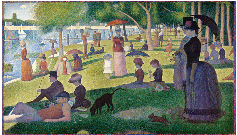
(Figure 3: Georges Seurat. A Sunday on La Grande Jatte , 1884. Art Institute of Chicago, Chicago.)