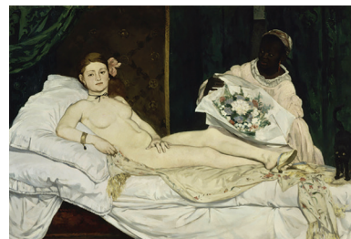
(Figure 8: Edouard Manet. Olympia , 1863. Musée d'Orsay, Paris.)

Valadon's depiction of this reclining woman is a direct response to an earlier depiction of a reclining woman: Olympia , 1863, by Manet (Fig. 8). Manet's depiction was itself a response to a painting known as the Venus of Urbino , 1538, by Titian (Fig. 9). Titian's depiction of a reclining woman serves as a model of ideal womanhood in the 16th century.