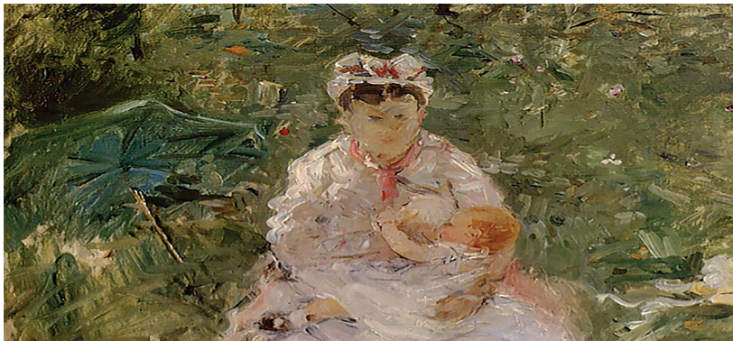
(Figure 1: Berthe Morisot. The Wet Nurse , 1879. Private collection, Washington D.C.)