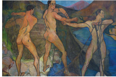
(Figure 6: Suzanne Valadon. Casting the Net , 1914. Musée National d'Art Moderne, Paris.)

In 1912, the couple visited Corsica, and Utter posed nude for Valadon's Casting of the Net , 1914, which was revolutionary for its use of a nude male model by a female artist (Fig. 6). 25