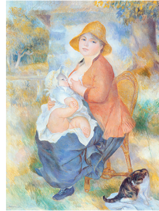
(Figure 4: Pierre-Auguste Renoir. Mother Nursing Her Child , 1886. Museum of Fine Arts, St. Petersburg.)

However, Morisot deviates from the Impressionist agenda by choosing to paint figures, subject matter that some of the other Impressionists avoided because of its inherent emotional implications. Moreover, Morisot has given us other images of mothers and children, such as The Cradle , 1872, that are emotionally realistic and unidealized views of the challenges of motherhood (Fig 5). It is difficult to imagine that, consciously and/or subconsciously, Morisot managed to paint an entirely objective image of this charged subject matter that is so relevant to her own life. Another revolutionary female painter who focused on gender-based issues was Suzanne Valadon. Marie-Clémentine Valadon, was born on September 23, 1865, in Bessines-sur-Gartempe, a small town located in central France.