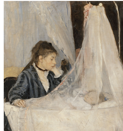
(Figure 5: Berthe Morisot. The Cradle , 1872. Musée d'Orsay, Paris.)