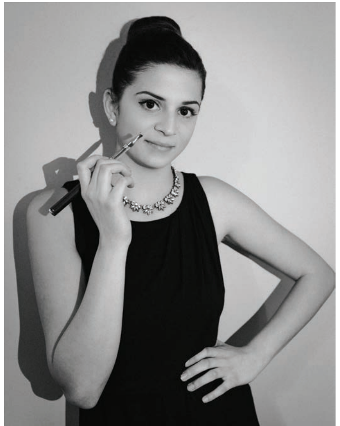
Audrey Hepburn, 2019 Inkjet print on Premium Luster photo paper 24 x 30 inches