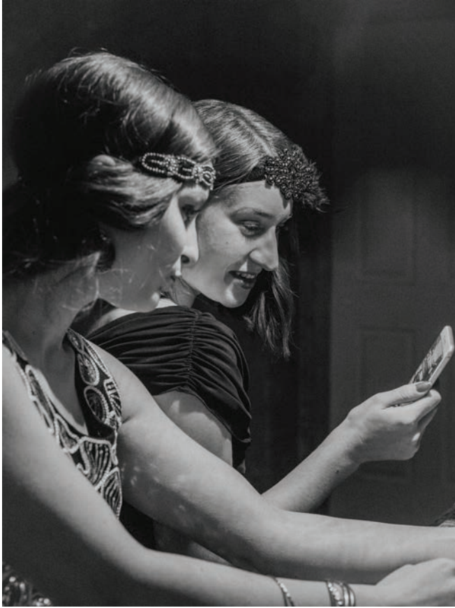
Flappers , 2018 Inkjet print on Premium Luster photo paper 24 x 30 inches