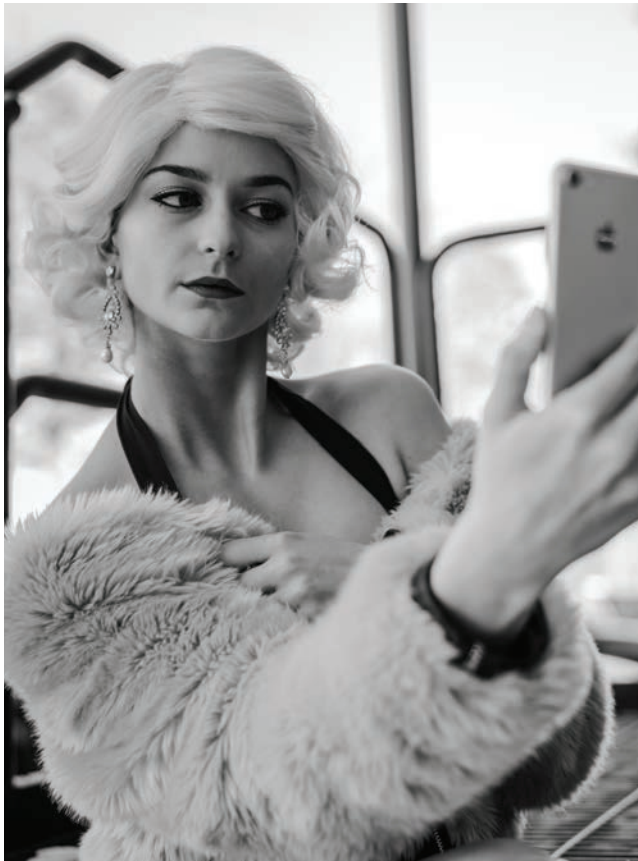
Marilyn Monroe, 2019 Inkjet print on Premium Luster photo paper 24 x 30 inches