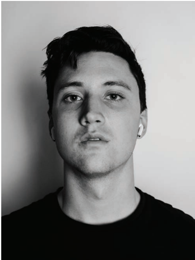
Elvis Presley, 2019 Inkjet print on Premium Luster photo paper 24 x 30 inches