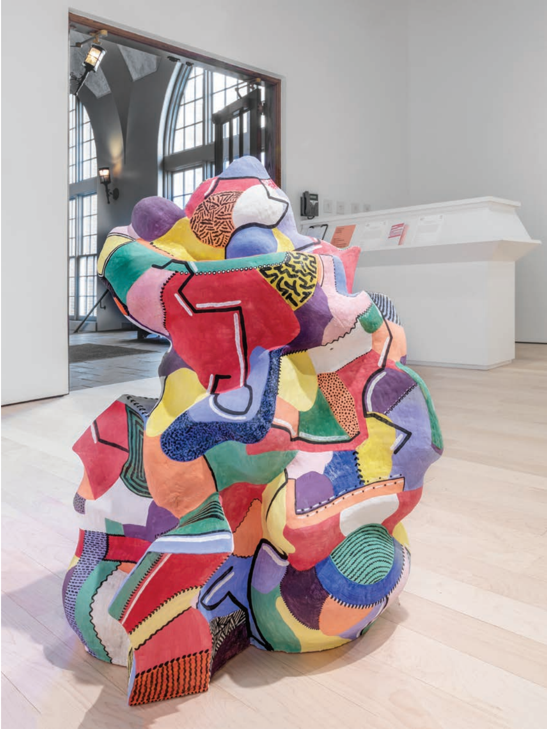
Trespassing Temperament , 2019 Stoneware with underglaze and glaze 38 x 30 x 27 inches