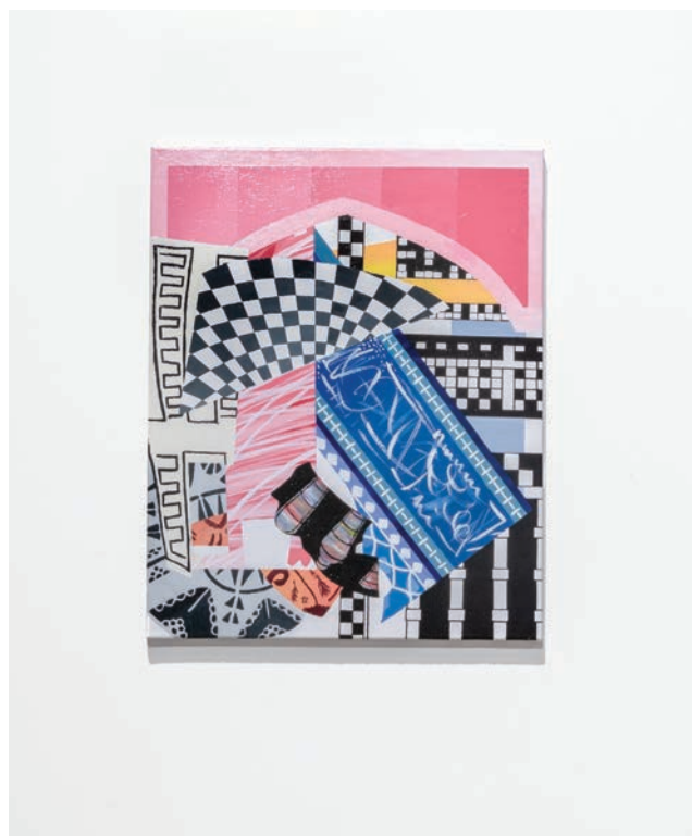
Overloaded , 2019 Acrylic on canvas 18 x 24 inches