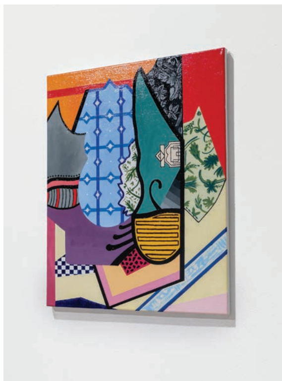
Off Switch , 2019 Acrylic on canvas 18 x 24 inches