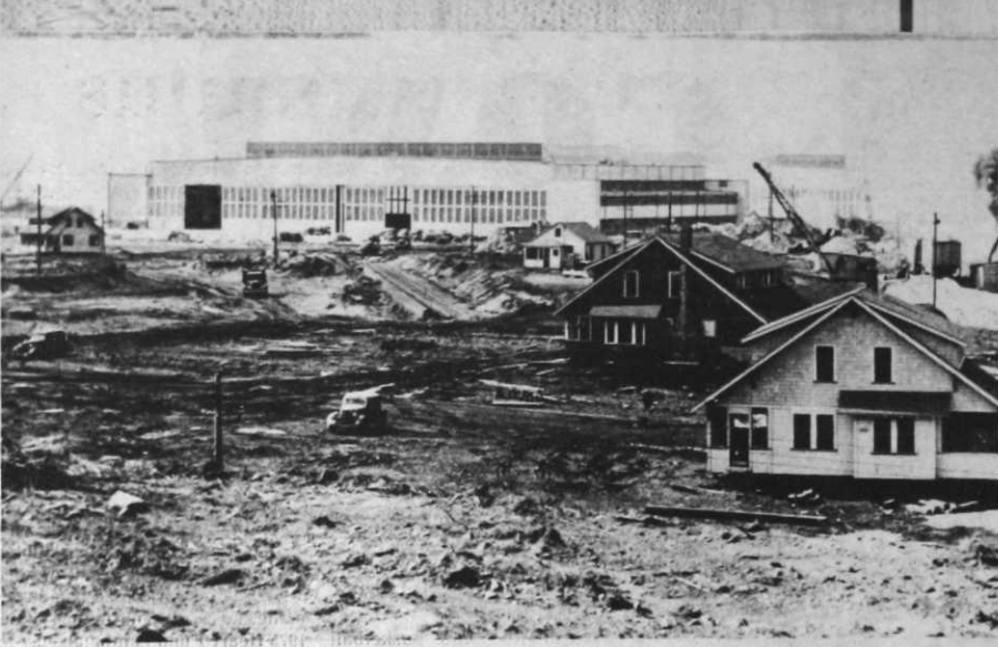
As it was: Quonset Point, Rhode Island, 1940 — destined to become part of country's key war bases.