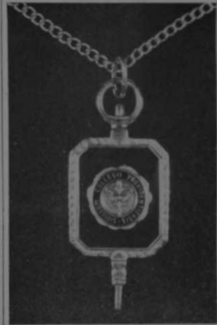
The Prom Favor pictured above is the gift of the Class of 1950 to all the young ladies present tonight. May it serve as a constant reminder of the Junior Prom of 1949.