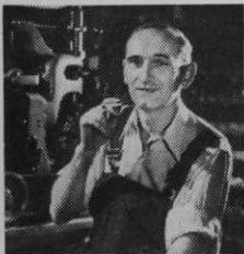
EDDIE CANTOR—America's great comic personality—each Monday evening on the Columbia Network, 7:30 pm E.S.T., 9:30 pm C.S.T., 8:30 pm M.S.T., 7:30 pm P.S.T.

They know how pleasant life can be when they "LET UP—LIGHT UP A CAMEL"