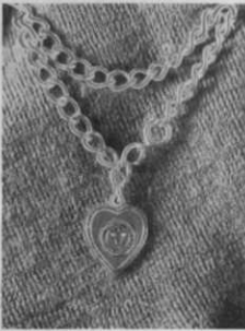
The favor which will be distributed to ladies at Sophomore Hop.