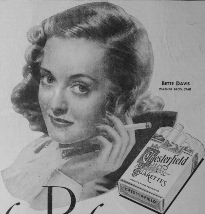
BETTE DAVIS WARNER BROS. STAR

Dress Clothes Rented Tuxedos Cutaways Caps and Gowns Read & White 214 Woolworth Bldg. Next to City Hall