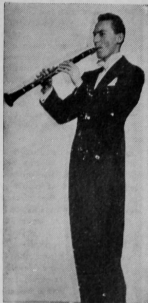
Woody Herman, clarinet playing virtuoso, will lead "The Band That Plays The Blues", at the Junior Prom on May 13, at the Biltmore Hotel.

Date for Social Highlight Is Set for May 13 at Biltmore Ballroom