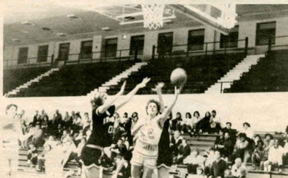
Lady Friars hope to get some national attention this year too!