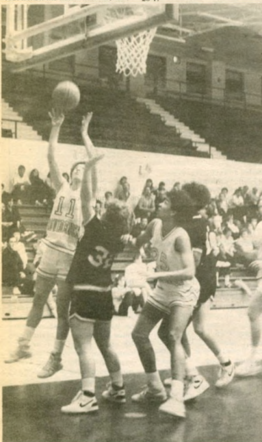
The lady Friar basketball team hopes to fill the upper seats in Alum- ni this year. Last year's successful season merits more fan support.